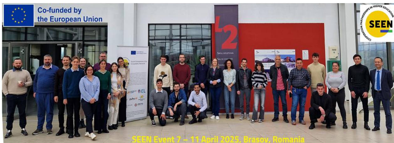
SEEN Event 7 – 11 April 2025, Brasov, Romania